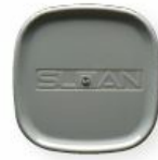
Sloan Optima Control Box